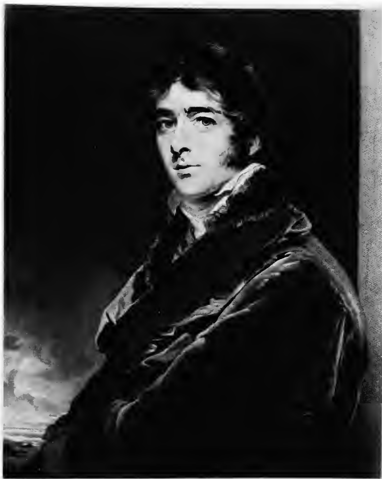
Viscount Melbourne After Sir T. Lawrence P. R. A.